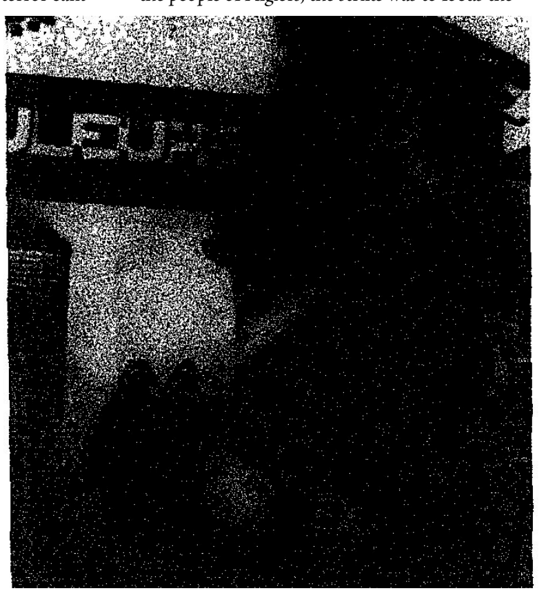
Paint work destroyed, a bomb 14 January 1957.

With terrorism in Algiers having reached unprecedented heights, the FLN decided to test their hold on the people. A general strike was announced for 28 January 1957. The population was informed that the strike would last eight days, that during the strike all Muslims were to remain indoors, that all shops were to remain closed and that all infractions would be met with punishment to include death. In addition to demonstrating FLN control over the people of Algiers, the strike was to focus the